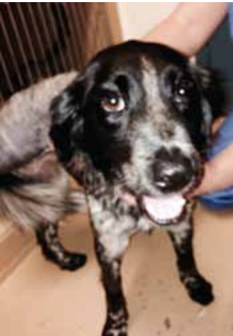
Petie - Lyndhurst, VA

A 10 year old Pomeranian, Lucky was taken to the veterinarian when he suddenly stopped eating. The veterinarian suspected an intestinal obstruction and advised surgery right away. The Mosby Foundation paid a portion of Lucky's surgery fee, and we are pleased to report that the aptly named pooch is recovering nicely after having a variety of foreign material - cotton, burlap and even an artificial flower (!) - removed from his gastro-intestinal tract.