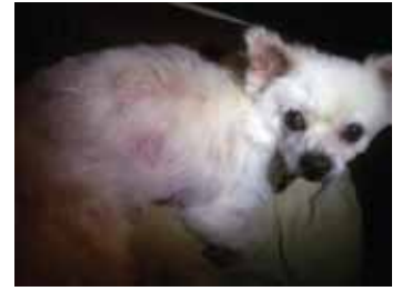
Lucky - Midway City, CA

This 9 year-old Airdale Terrier developed a large mass on his neck that needed to be removed. The veterinarian did not know if the mass was cancerous, but it was fluid-filled and at risk for rupturing, so surgery needed to be performed as soon as possible. Nathan's family contacted The Mosby Foundation, and we made a contribution toward Nathan's surgery fee. We wish him a full recovery and a good long-term prognosis.