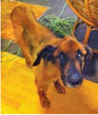
Max - Versailles, KY

We are helping so many dogs, we do not have space to list them all!