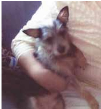
Crash - Nashville, TN

Pepper's family contacted The Mosby Foundation for assistance when the 4 year old Pit Bull Terrier mix was diagnosed with Immune-Mediated Hemolytic Anemia and a urinary tract infection. IMHA is a potentially fatal disease that occurs when the dog's own immune system starts killing off the red blood cells needed to carry oxygen throughout the body. We made a contribution toward Pepper's follow-up care, and we wish her a successful treatment with a long remission.