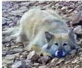
Stormy - Sugarloaf, CA

A 6 year old mixed breed, Daisy needed surgery to stabilize her luxating patellas (dislocating kneecaps). The Mosby Foundation made a contribution toward Daisy's surgery fee, and she has an excellent prognosis.