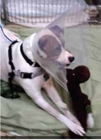
Pepper - Chicago, IL

We are helping so many dogs, we do not have space to list them all!