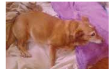
Bailey - Staunton, VA

Poor Percy, a 3 year old Chihuahua-Pug mix, was diagnosed with painful bladder stones and needed surgery right away. Percy's family applied to The Mosby Foundation for assistance, and we made a contribution toward Percy's veterinary care.