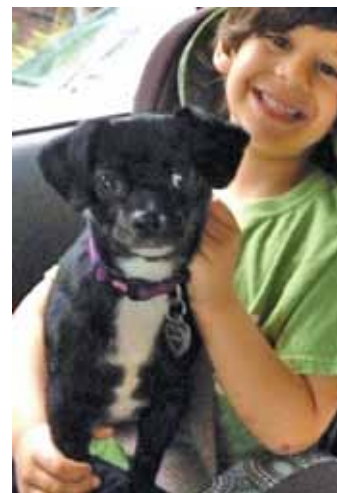
Percy - Norcross, GA

A 7 year-old Labrador Retriever mix, Blacky developed a large tumor on his chest that needed to be removed. The Mosby Foundation made a contribution toward Blacky's surgery fee, and we hope for good news on the biopsy report!