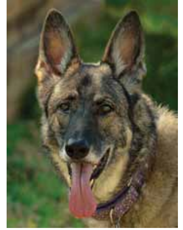
Ella - Bethlehem, GA

Stormy's human companion approached The Mosby Foundation for help to continue to treat the 4 year old Shepherd-Collie mix for a rare liver disorder called Copper Storage Disease. Stormy had already been diagnosed through extensive blood testing and a surgical liver biopsy, but she needed a special diet and medication to keep her healthy and happy. The Mosby Foundation made a contribution toward the cost of Stormy's continuing care.