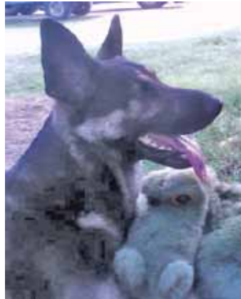
Shadow Bear - Little Lake, MI

An 8 year old German Shepherd mix, Max was taken in by a family member, when his original owner could no longer care for him. Max's care had been neglected. He was taken to a groomer to be shaved and bathed. When the matted fur was removed, she found a large mass on Max's neck. A veterinarian determined that the tumor was probably benign, and he hoped that surgical removal would be successful to improve Max's quality of life. The Mosby Foundation contributed a portion of Max's surgery fee and wish him a speedy recovery.