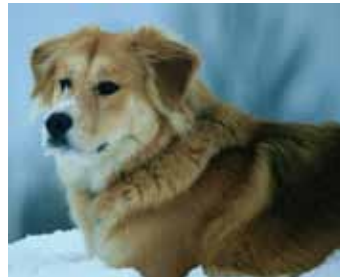
Abbey - Williamsville, NY

This 4 year old Fox Terrier-Shetland Sheepdog mix developed a rare disorder called Chylothorax, where fluid builds up in the chest cavity, interfering with normal breathing and putting extra stress on her heart. Surgeons at the University of Tennessee Veterinary Medical Center found and closed the leaking vessel in Rowdy's chest to give her a chance at a normal life. The Mosby Foundation and others provided financial assistance and we wish her a speedy recovery.