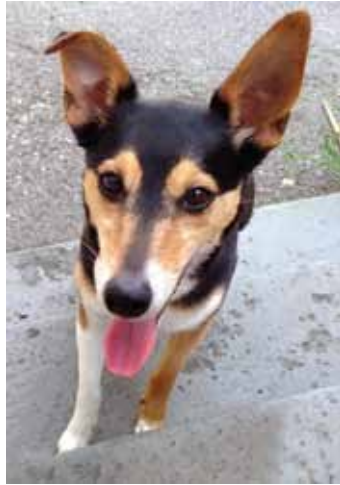
Rowdy - Knoxville, TN

Poor Crash was taken in by a family member after his owner died unexpectedly. Crash's family could only afford the most basic care, but the 2 year old Schnauzer mix had developed severe dental disease, and he needed to have several badly diseased teeth extracted. With a contribution from The Mosby Foundation, Crash had his extensive dental procedure, and we are sure he is feeling much better now.