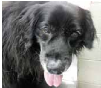
Blacky - Pulaski, VA

This 2 year old mixed breed dog suffered a fractured right femur. Originally thought to be a hit-by-car injury, x-rays revealed that Petie had been shot, and the fracture was severe enough to possibly require amputation of the leg. The Mosby Foundation made a contribution toward her medical care, and we are pleased that a neighbor has since adopted Petie, and we hope she stays safely at her new home!